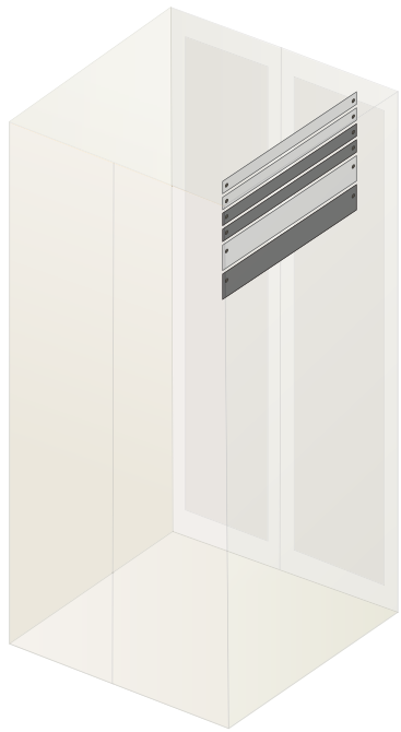
Front view :